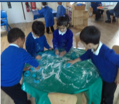
Children in Nursery have been making playdough by themselves.