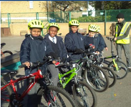
Children in Year 4, 5, 6 have been enjoying developing their cycling skills all week with qualified trainers from BikeWorks.