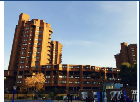
The towers looking beautiful on these crisp, cold mornings!