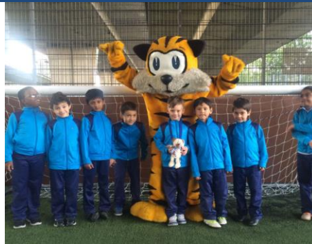
Yr2 with the QPR football schools project