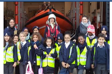
Y4 make a smash in Whitstable