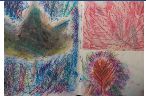
Brilliant seasonal art in Y5