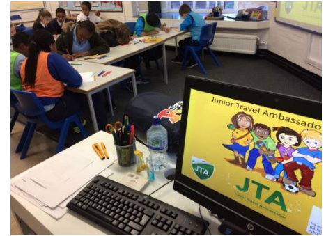
Y6 getting involved in the Junior Travel Ambassador project