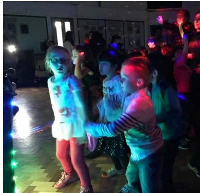
Amazing winter disco on Wednesday!