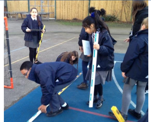
Yr 5 measuring the perimeter of the pitches