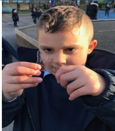
Icy in the playground this week!