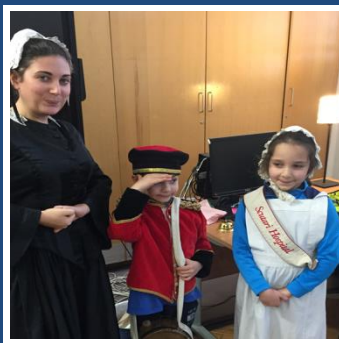
Yr2 getting to know Florence Nightingale herself!