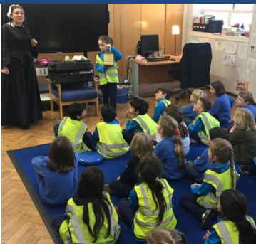
Yr2 learning about history with Fox Primary pupils