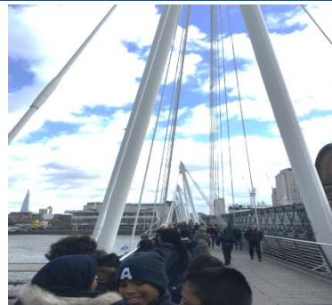
Yr6 on their way to the National Theatre this week to see Romeo and Juliet