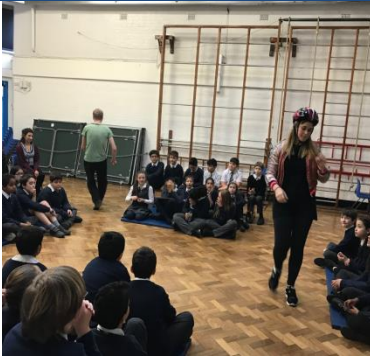
Road Safety workshop at Ashburnham