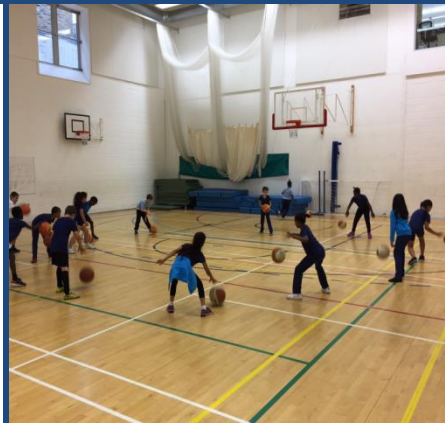
Y3 at Chelsea Academy