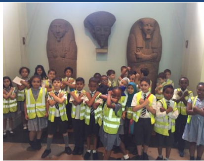
Yr3 at the British Museum