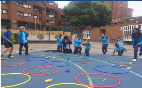
Yr6 working with EYFS during sports week.