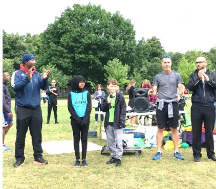
Head boy and Head girl at the KS2 Federation sports day.