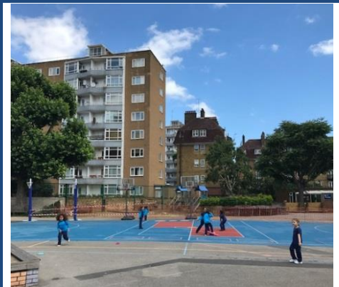
Playground- what's missing?