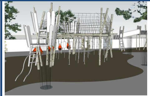
Sketch of the climbing structure to be built this Summer