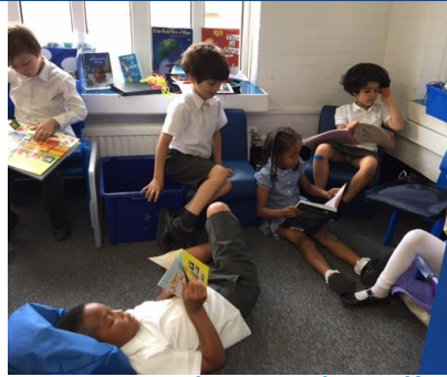
Drop everything and read!