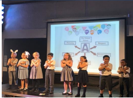
Y4's fantastic class assembly