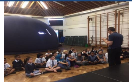
The Science Dome has landed!