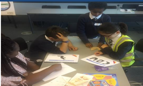
Y5 collaborating to come second in the Maths Challenge this week