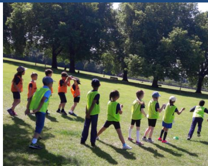
Y2 multisports at Battersea Pk