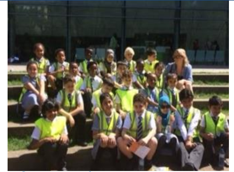
Y3: Natural History Museum