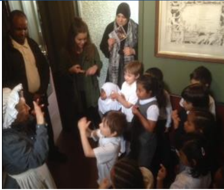
Y1 at Linley Sambourne House