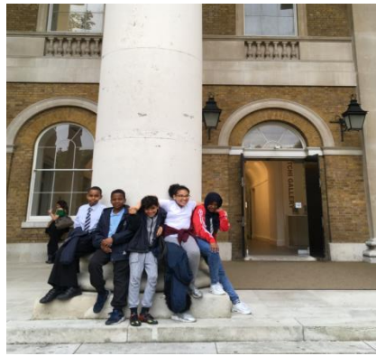
Y6 at the Saatchi Gallery