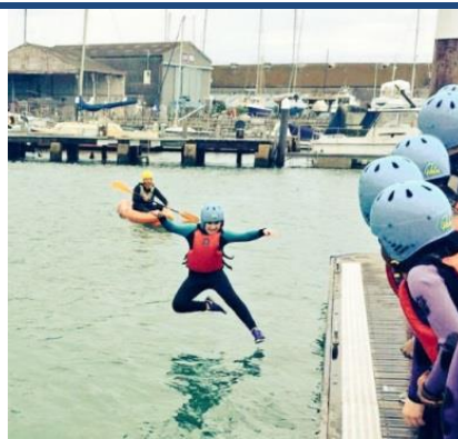
Y6 leaping in at the Isle of Wight- a wonderful week of activities