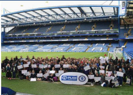
The Girls football visit on the CFC pitch

The heat! Well done to everyone for making it through the hottest school week in memory.