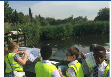
Y4 at the Wetlands centre