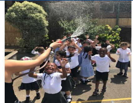
Ashburnham surviving the heat this week