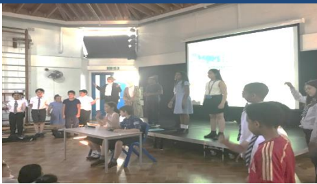
Y5's wonderful class assembly