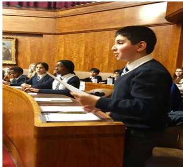
Yr6 in action at the Children's Parliament.