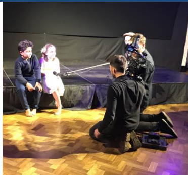
Romeo and Juliet calmly dealing with the media attention