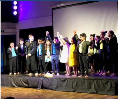
The triumphant cast of The Big Shakespeare Assembly.

Check your inboxes: we are also emailing the newsletter this week