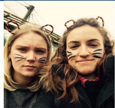
Wild animals spotted during the Yr2 Visit London Zoo.