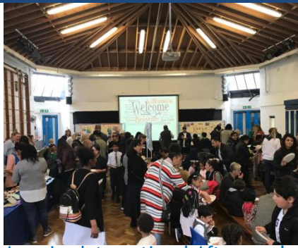
Amazing International Afternoon!