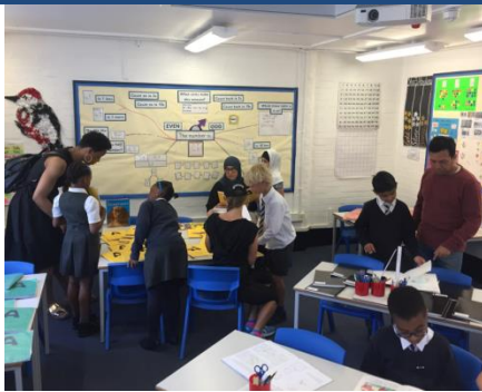
Y3 Parent Showcase