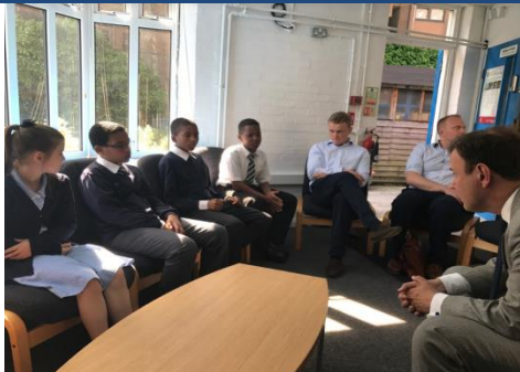
Ash pupils grilling Greg Hands MP on a range of burning issues