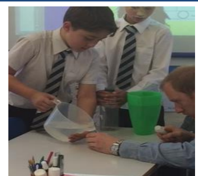
Y3 studying volume and capacity