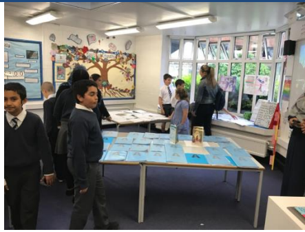
Y5 Parent Showcase