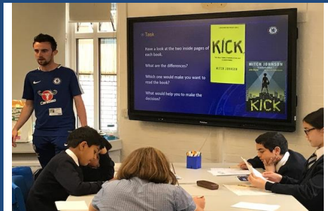
Y6 working with CFC on literacy