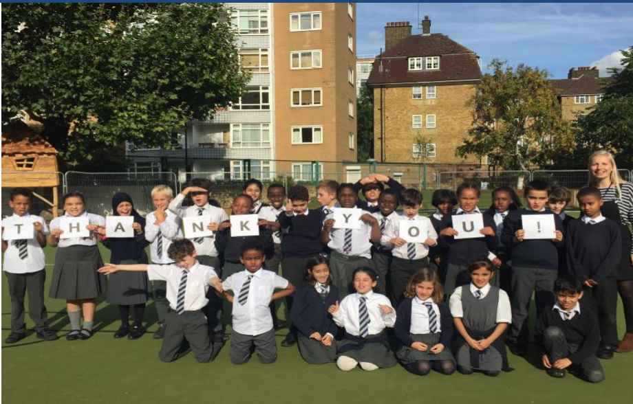
Y4 showing their gratitude to everyone for the support with the bake sale