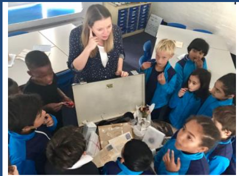
Enthralling book club this week