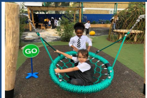
Reception enjoying the latest addition to their outdoor area