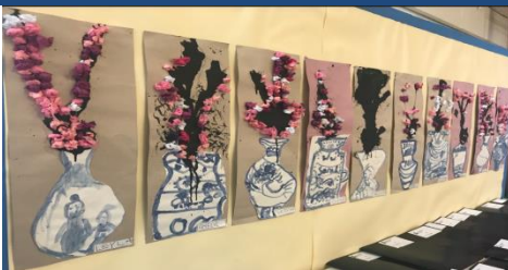
Amazing art from Y1