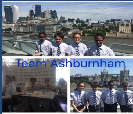
Our Maths experts at the Maths Challenge today