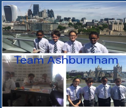
Our Maths experts at the Maths Challenge today