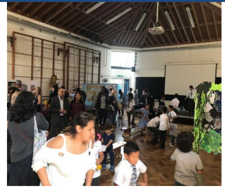
Last week's Art Expo