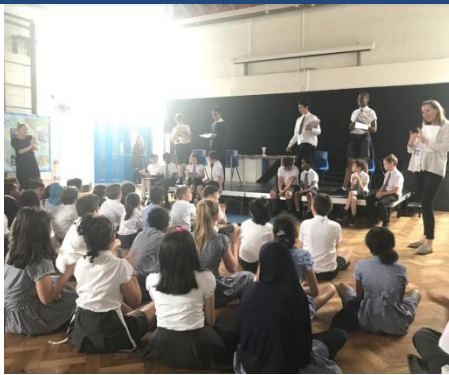
Spelling Bee this week- hot competition!