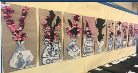
Amazing art from Y1