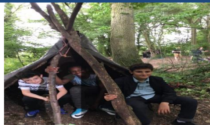
Y5 go wild in Essex!