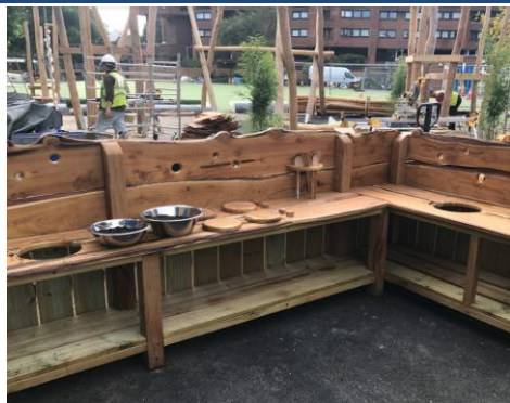
The Reception mud kitchen- deluxe!