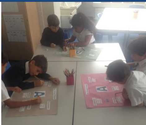
Y2 working on their Ashburnham Values posters

A warm welcome to all our returning pupils, and also to all our new students starting in Nursery and Reception. Great to see all of you back, on time and ready for the new term. The children have been excellent this week- a fantastic start to the new year.