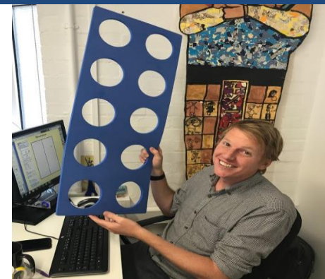
Mr East loves maths resources!