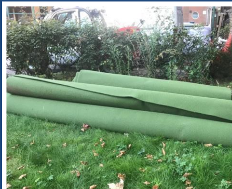
Extra carpet- let us know if you would like some