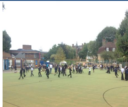
The children enjoying the new pitches