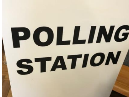
Democracy in action at Ashburnham