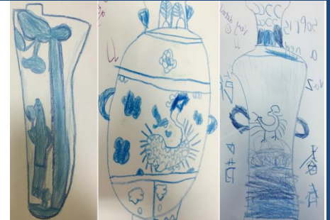
This week Y1 studied Ming dynasty vases as part of their unit on Chinese art