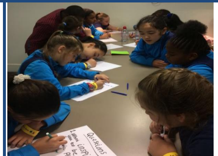
Y5 Girls at Stamford Bridge as part of CFC project