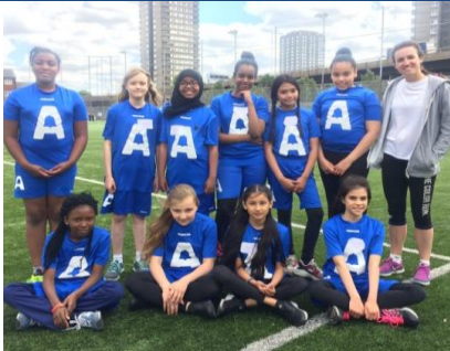
Yr6 Girls at the Westway Cricket Festival