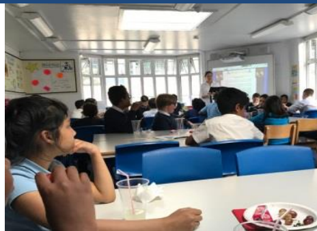
Well attended Bookclub this week in Key Stage2