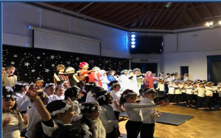
Nursery, Reception, Y1 and Y2 belting out a fabulous nativity.

Quote of the week: "Christmas is not a time nor a season, but a state of mind." – Calvin Coolidge