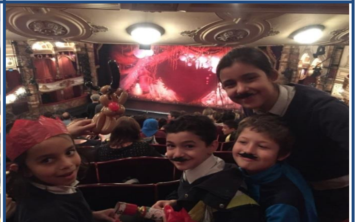
Moustachioed choristers at The Nutcracker on Thursday