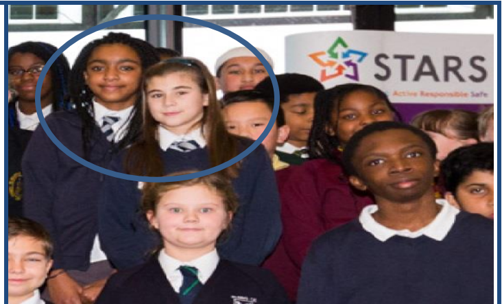
Our Sports Captains collecting their award at the TFL STARS event