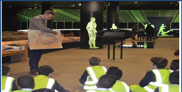
Y4 at the Guildhall Roman Amphitheatre