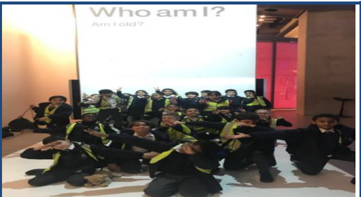
Y3 at the science museum this week