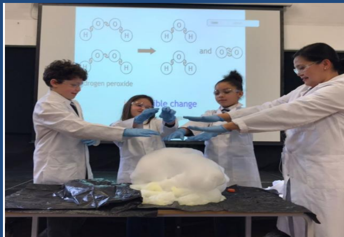
Hands on experiments this week!

Quote of the week: " What sculpture is to a block of marble, education is to a human soul." Joseph Addison