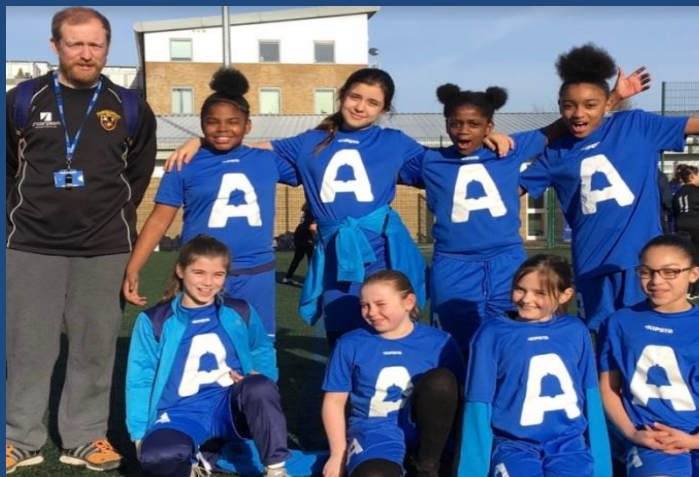
The courageous Girls' Football team campaigning