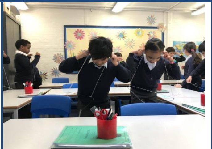
Y3 getting the hang of it.