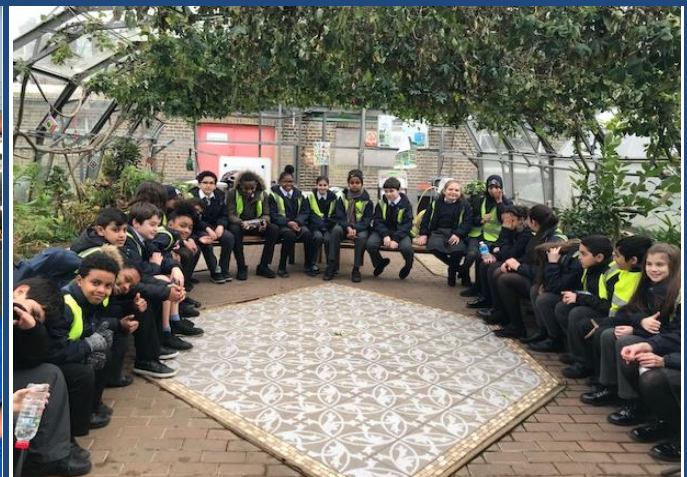
Y6 at the Ravenscourt Park Greenhouse