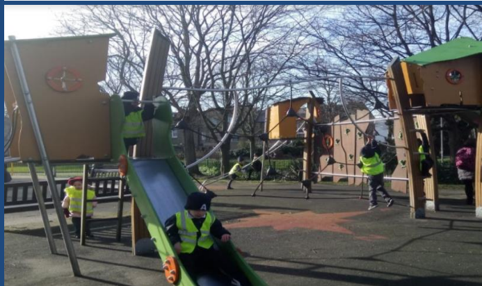
Reception enjoying Westfield Park

It has been a very fruitful half-term. The children really have been growing academically and personally these last few weeks. Everyone deserves a week's rest! Have a great half term break- see you on Tuesday 20th. -Ash staff