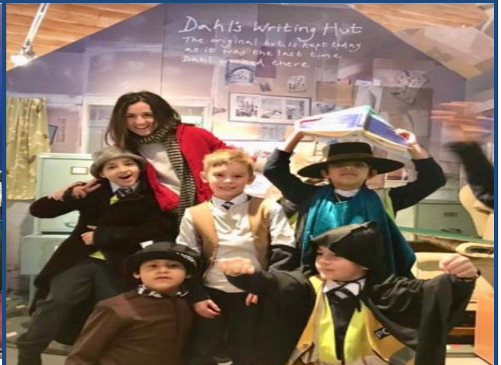
Y3 at the Roald Dahl Museum this week