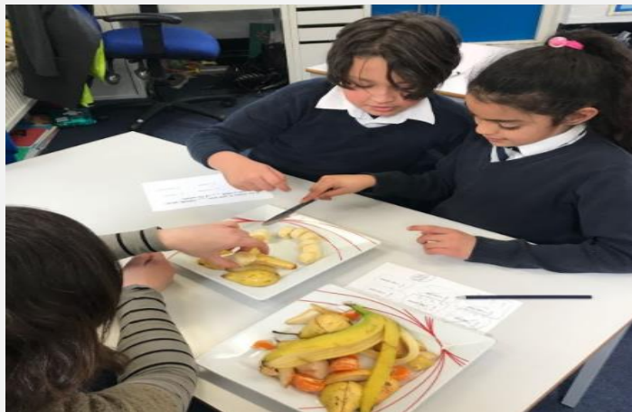
Fractions in real life