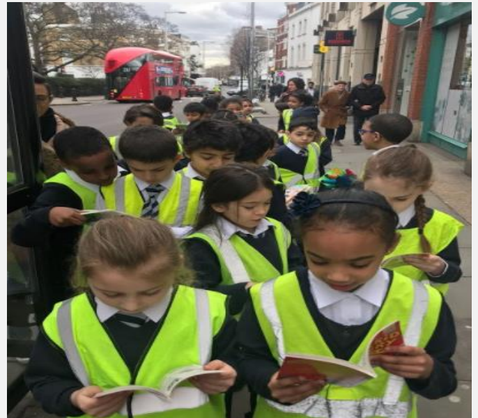
The keenest readers!