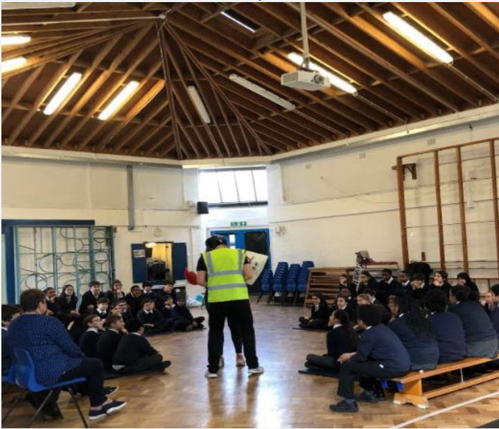
Y6 Road Safety this week