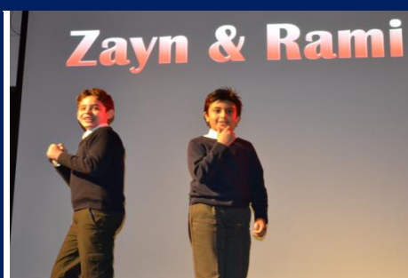
Amazing Talent Show this week