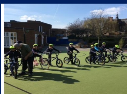
Cycle training in the sun