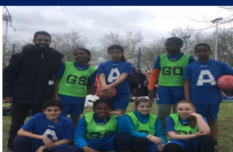
Our fantastic Netball team- 5th in London!