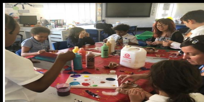
This week at Our Space club