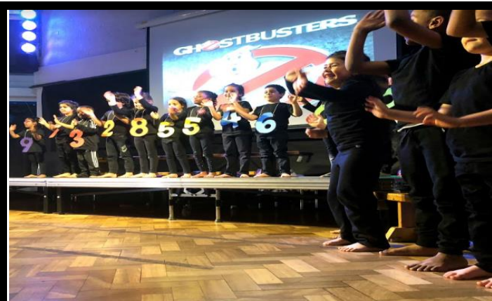
Y1's fabulous class maths assembly

Quote of the week: ‘SATS stands for Some Annoying Tests’ Y6 pupil this week (!)