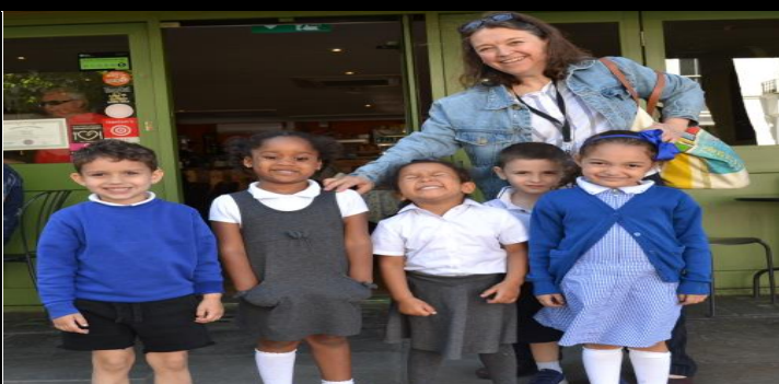
Nursery visiting Mona Lisa this week!