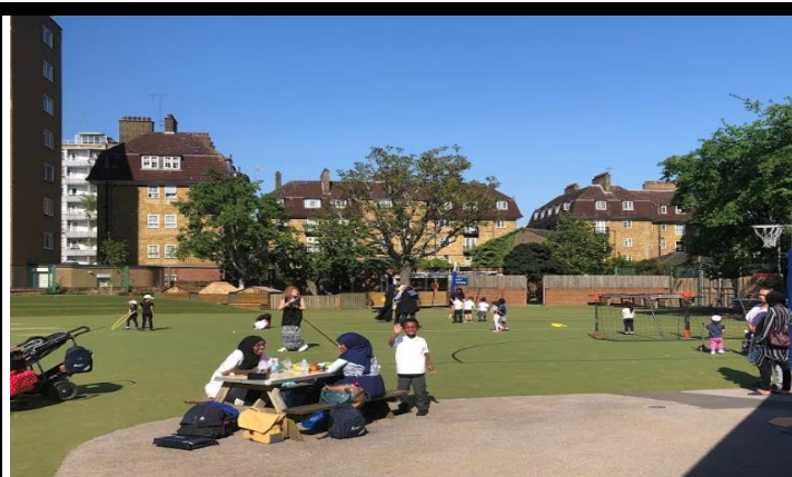
Tuesday's parents/carers Stay and Play