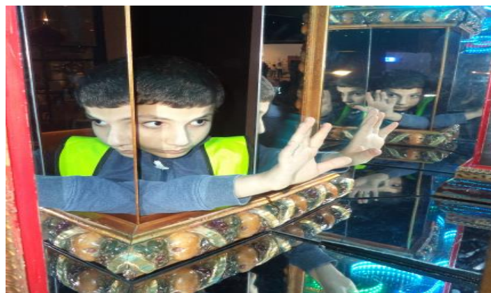
Y5 at the Science Museum