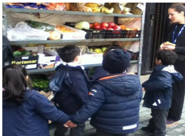
YRec out and about shopping locally