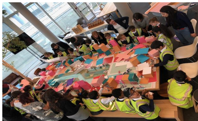
Y3 at Foster and Partners designing a city!