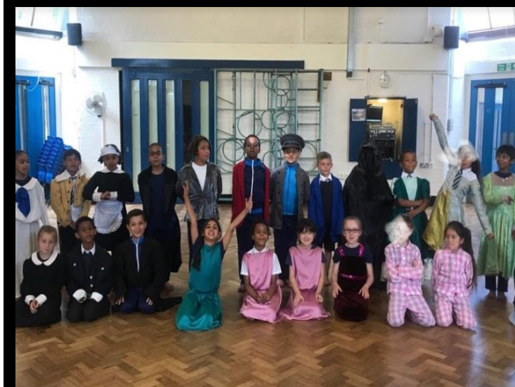
Y3 ballet workshop this week!