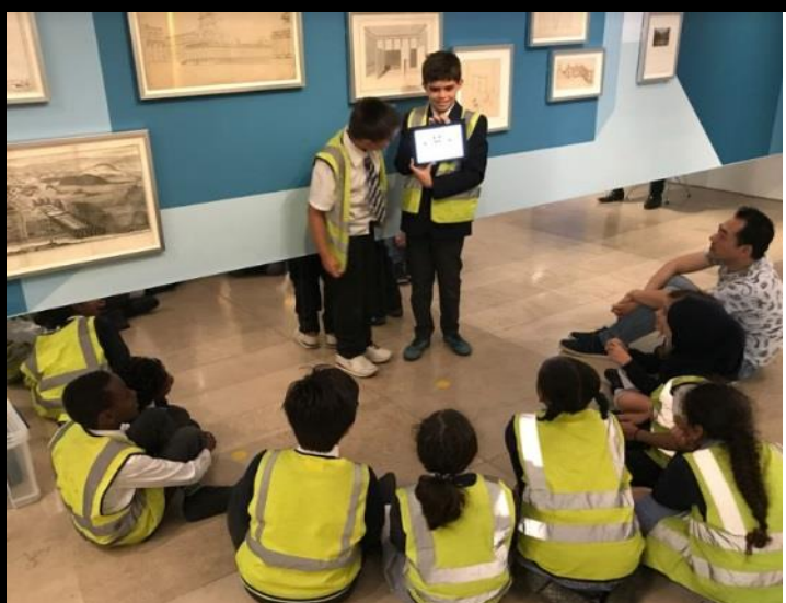
Y4 at Royal Institute of British Architects