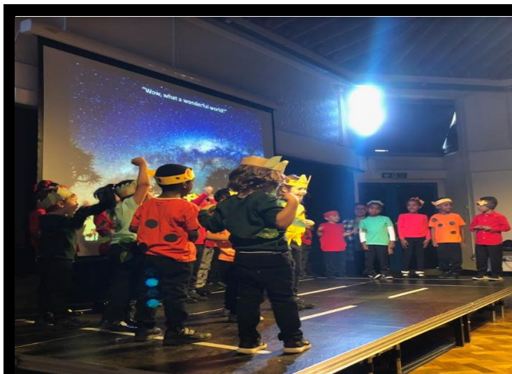
Reception dazzling us with their assembly

Quote of the week: 'The highest result of education is tolerance.' Hellen Keller