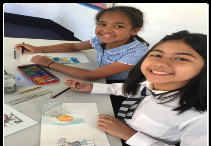
Y5 Drawing Roald Dahl characters