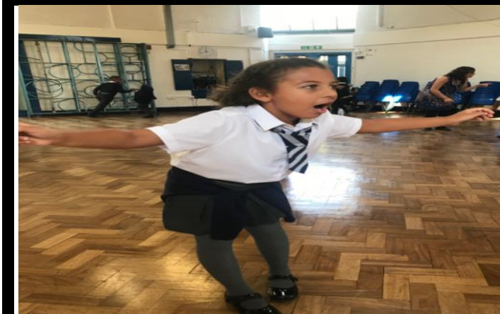
Y3 Acting out the opening from the BFG