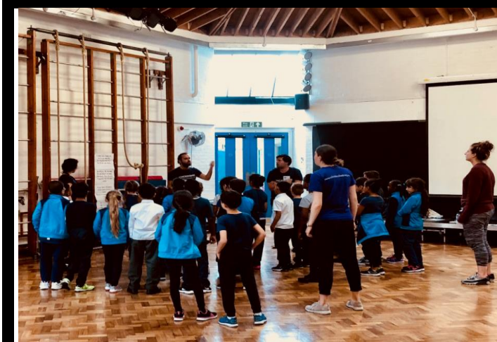
Chickenshed Theatre company with Y4