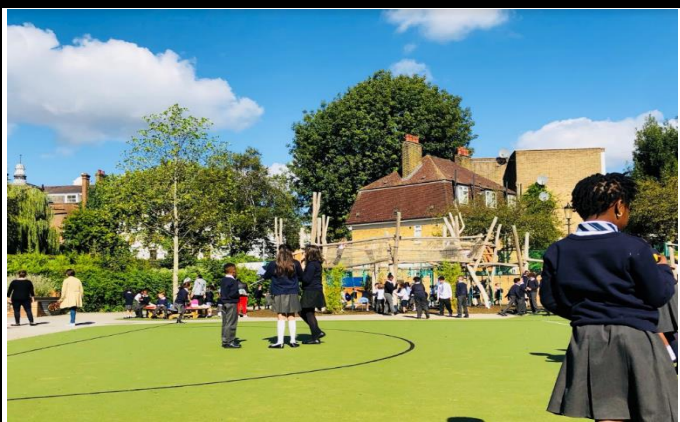
Everyone enjoying being back in the playground this week