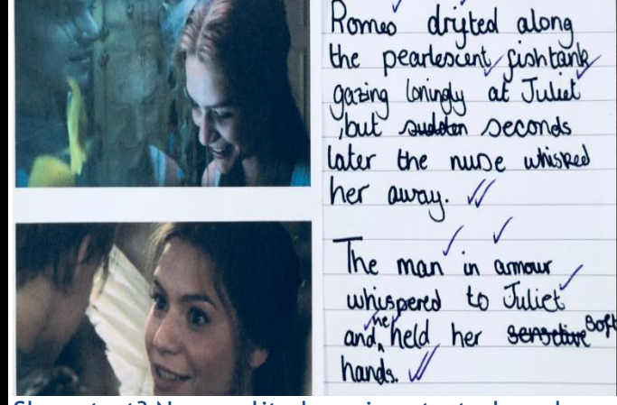
Slow start? No: quality learning started on day one