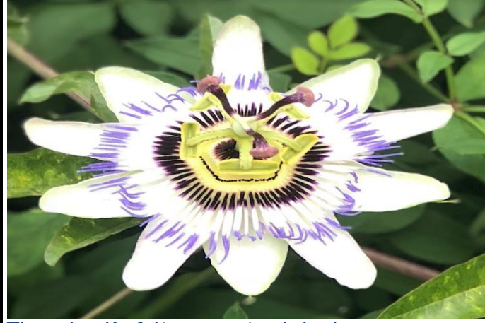
The school's foliage survived the heat